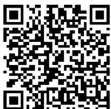
Scan for the full upcoming event schedule

Regardless if you are for or against the opt out, everyone has made it clear they want the school and community to thrive. Votes will be cast on this next Tuesday to see which route the community will take.